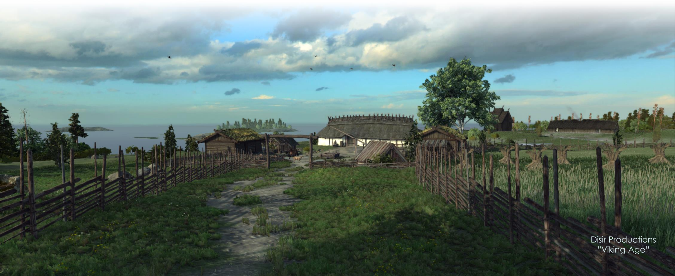
Disir Productions "Viking Age"